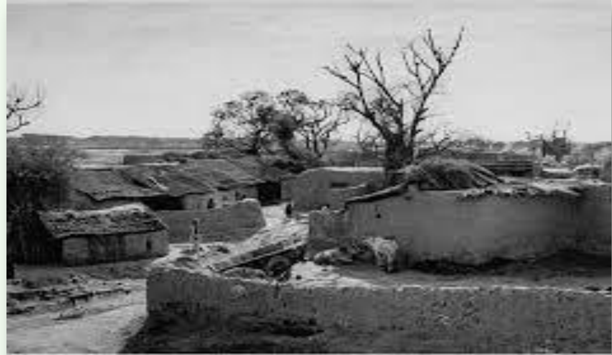
Rurki Village, which is now Sector 17 Chandigarh

Partly to compensate for this loss Nehru chose Chandigarh for the site of the new capital. It was on the border of both the Punjab and Haryana – both large, economically and politically important states – but the place itself was pretty boring – mainly rural with no important architecture.